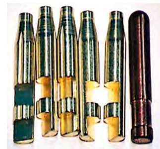
Set of electrodes